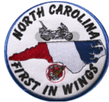
NC. District Smithfield